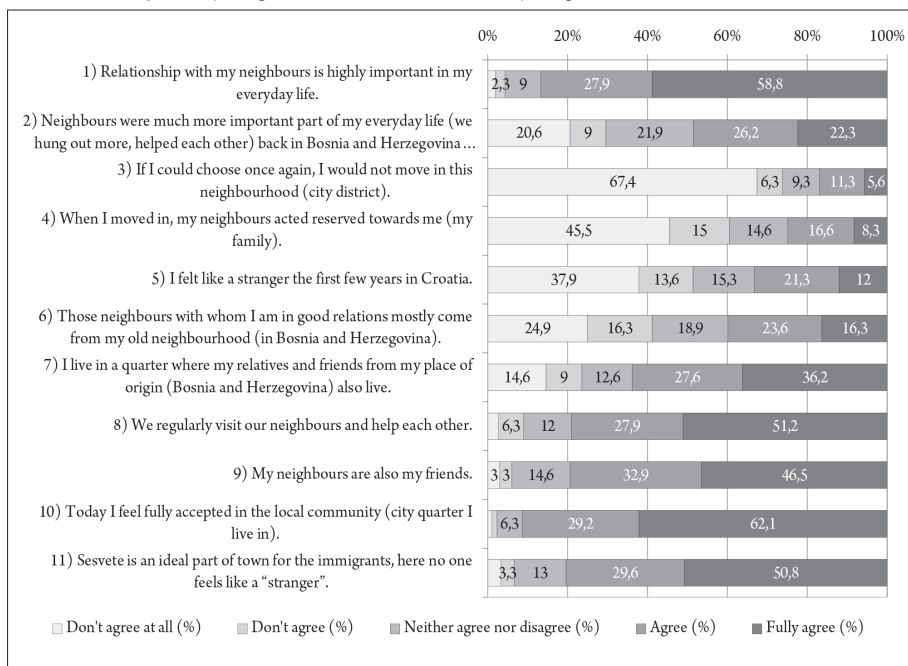
Chart 2: Perception of neighbourhood and relations of neighbours

The analysed differences based on sociodemographic, socioeconomic and contextual variables yielded a number of statistically significant results. The perception that the relations with neighbours are a very important part of their life is the least present among the youngest respondents ( H(3)= 15.493 ; p=0.001 ). The respondents with the lowest educational attainment agree the most that the neighbours acted reserved towards them when they moved in ( H(2)=