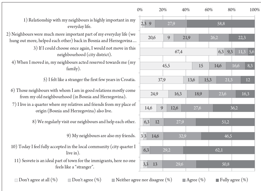
Chart 2: Perception of neighbourhood and relations of neighbours

The analysed differences based on sociodemographic, socioeconomic and contextual variables yielded a number of statistically significant results. The perception that the relations with neighbours are a very important part of their life is the least present among the youngest respondents ( H(3)= 15.493 ; p=0.001 ). The respondents with the lowest educational attainment agree the most that the neighbours acted reserved towards them when they moved in ( H(2)=